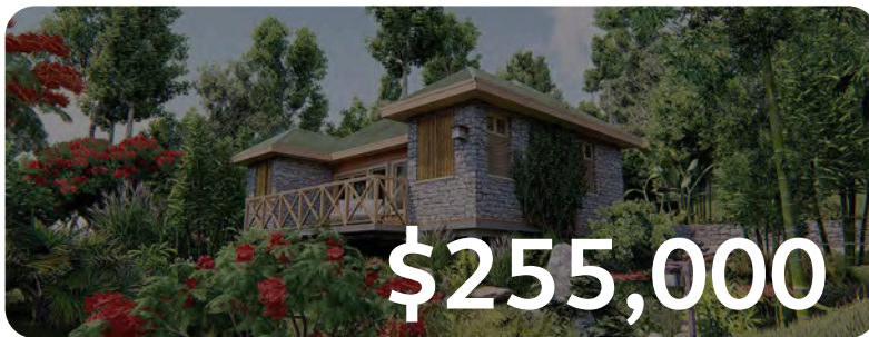
A villa in full ownership*