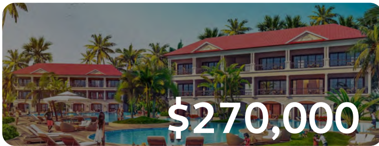
A suite in full ownership*

Invest in luxurious resorts and acquire citizenship of Dominica. All properties are approved by the government and can be purchased as full ownership or co-owned.